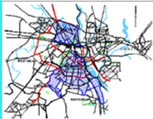
J P Kenny undertook the feasibility study and detailed design of the distribution network in Delhi, India