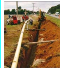
A cross country distribution supply main, under construction.

J P Kenny reviewed and updated proven and unproved reserves, Carried out analysis of system demand requirements, developed a network plan and undertook extensive system hydraulic modelling, develop cost estimates including system transport tariffs for the developed options.