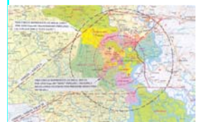
The Master Plan dealt with development of gas distribution systems around Ho Chi Minh City, Vietnam.