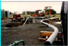
Pipeline facilities under construction.