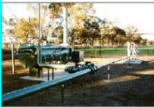
Pipeline facilities allowing the safe operation of the distribution network.